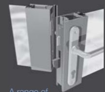
A range of handle styles and colours.